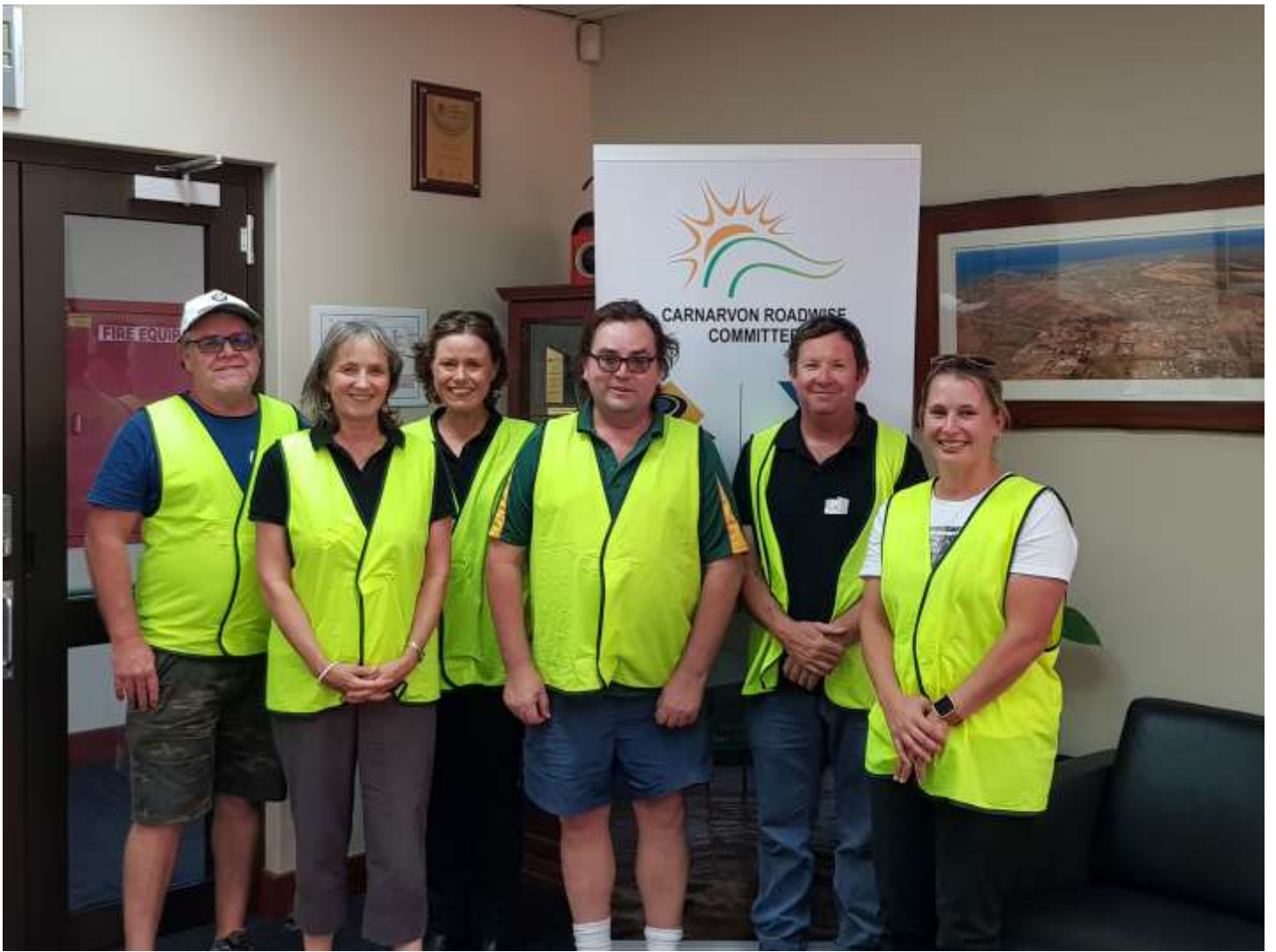
Carnarvon CCR Course Participants and Trainers