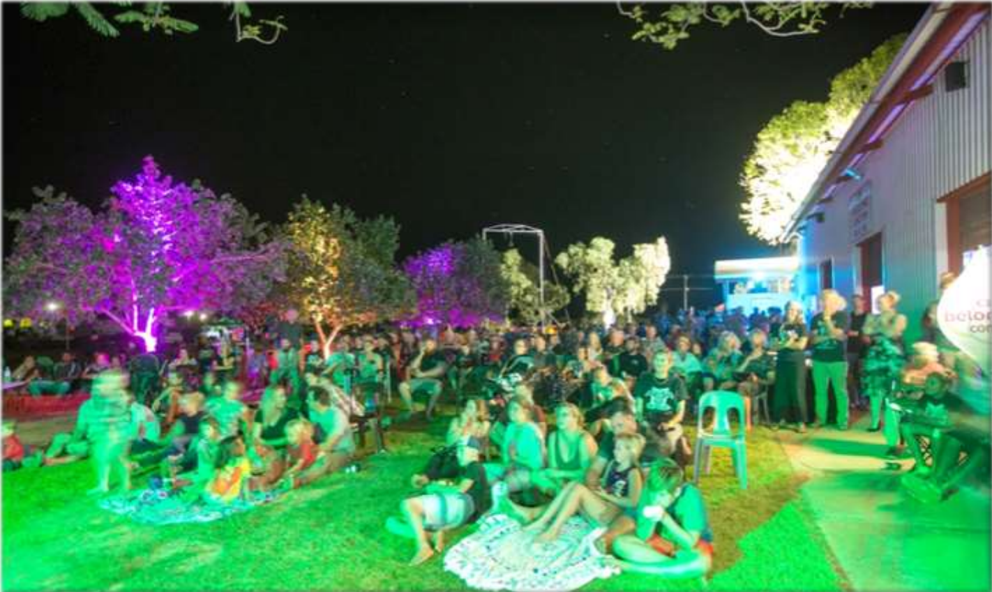
The crowd that came from near and far to enjoy this fabulous weekend of music & entertainment.