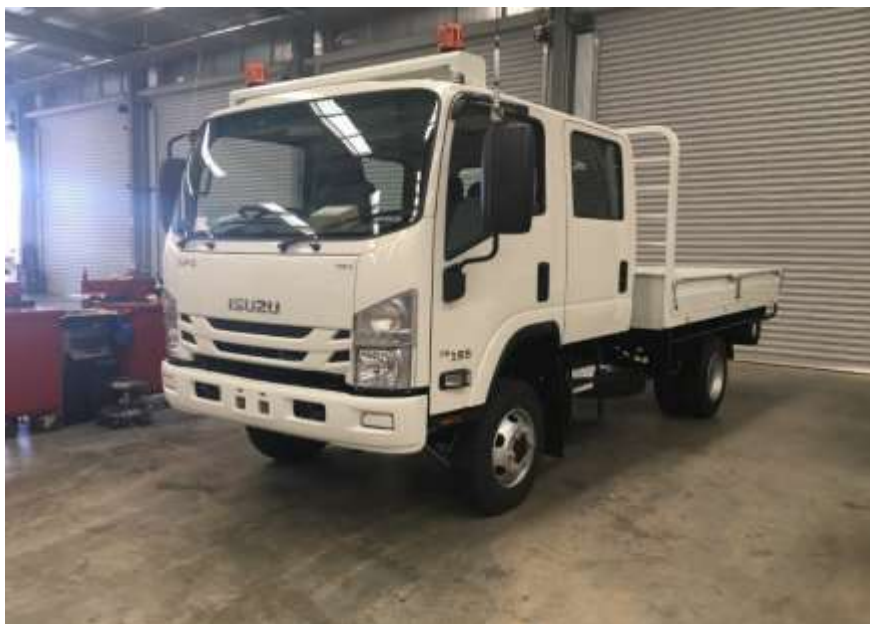
New service truck before accessories were fitted

The new service truck has arrived. P39 was cleaned and the fuel tank, tool box and crane removed to be fitted onto the new rig. Total changeover price was $61,236.00.