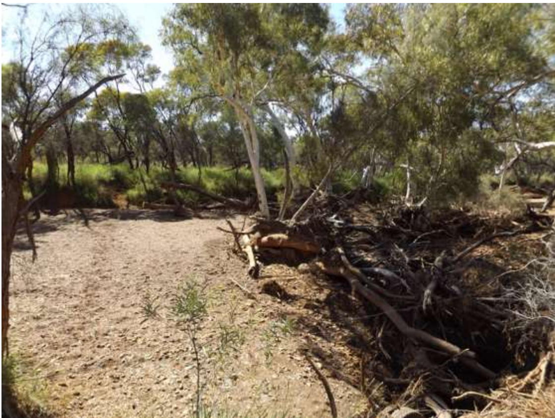
Lopped and dropped trees caught on Steel Wire Rope, and other trees in the channel, after being washed downstream. A very effective sieve that as held approximately 5,000 cubic metres of sediment in the creek bed, Pingandy Station.