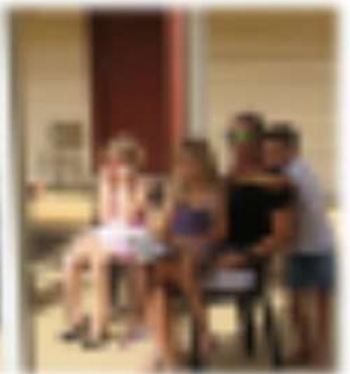
Local community and visitors that came out for the ANZAC Ceremony at the Shire Office.