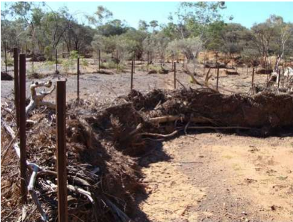
Rake made from drill rod grouted into holes drilled in bedrock, Three Rivers Station.

Rakes. Rakes are made by placing a line of vertical posts into a creek bed across the flow. Multiple rows make for a more effective sieve.