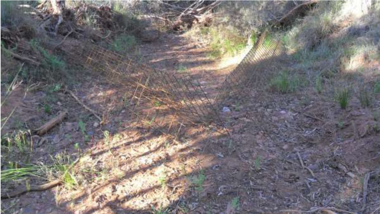
Two triangles of F82 installed in a V, facing upstream, Pingandy Station.