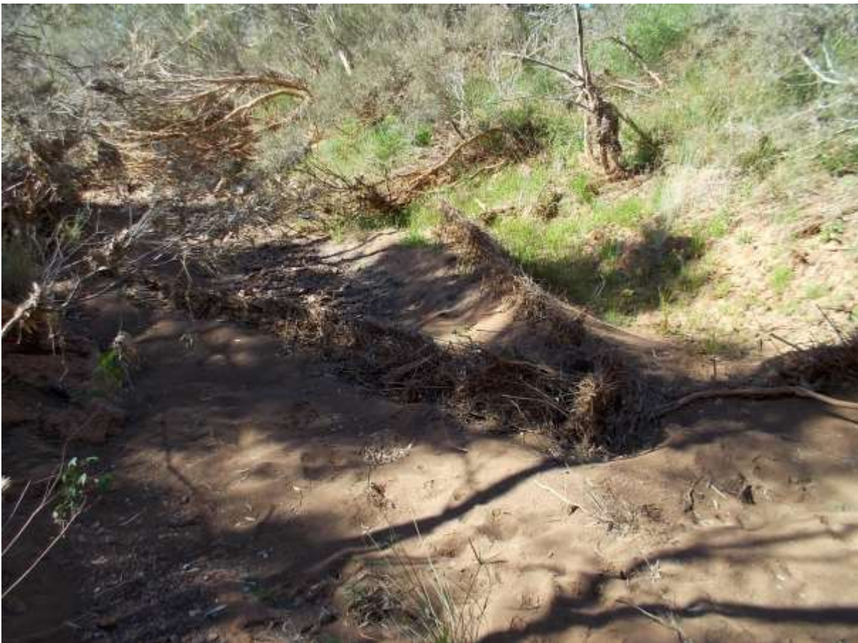
The triangles seen above, now silted up after three flows. This sieve has held up over 3,000 cubic metres of silt, Pingandy Station.

Suspension sieves can be used from small gutters to the largest rivers and high flow situations. All sorts of things can be suspended, including; vegetation; ringlock; mesh; gates etc. On high flow spans of more than 6 metres, 10mm or bigger SWR should be used.