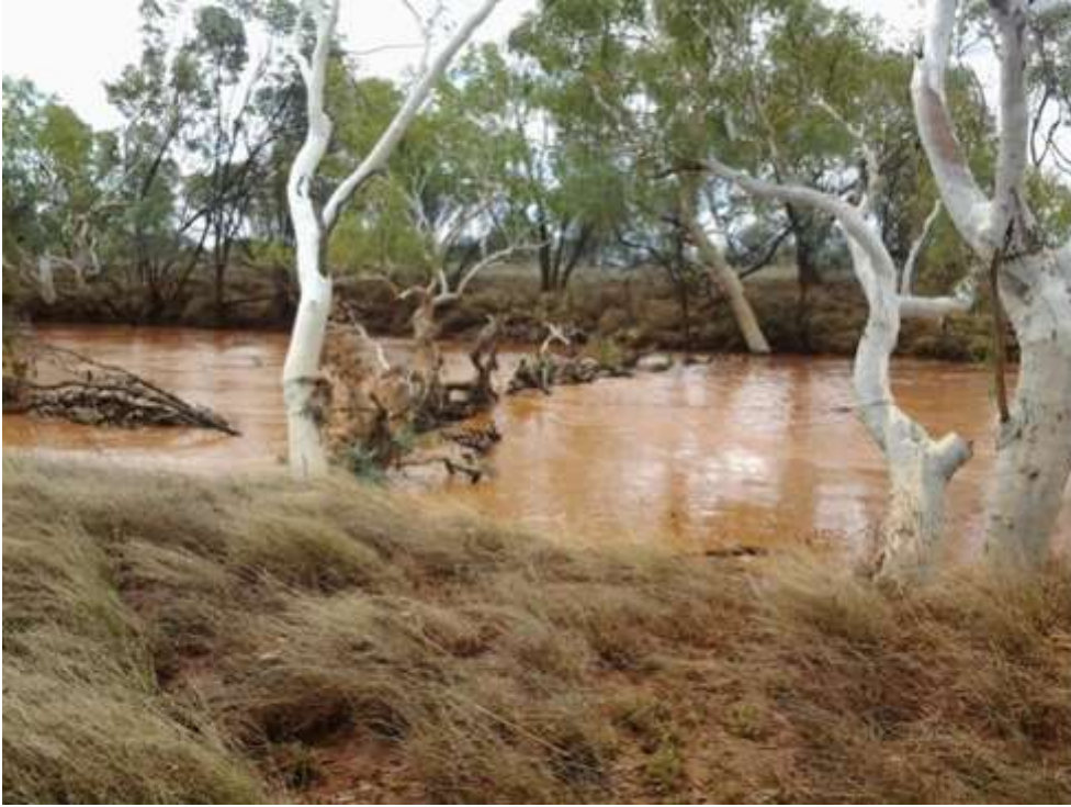
Suspension sieve catching debris. Mt Augustus Station.

Rakes. Rakes are made by placing a line of vertical posts into a creek bed across the flow. Multiple rows make for a more effective sieve.