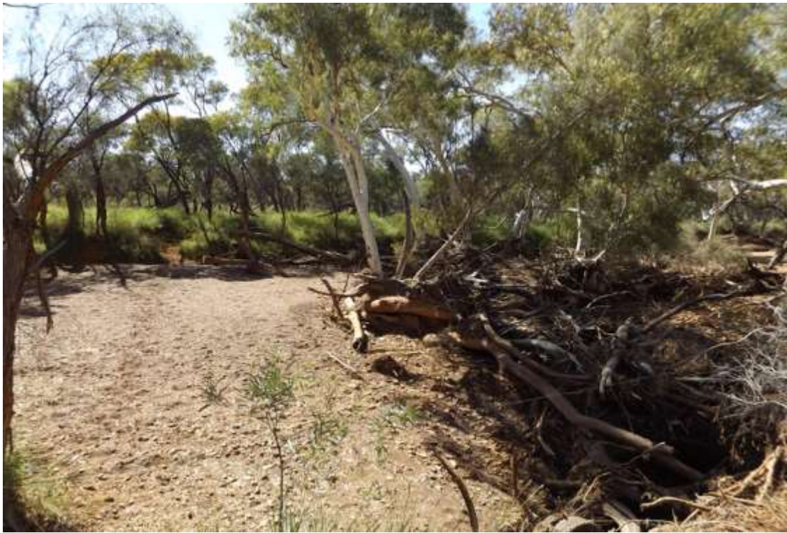
Beaver dam pushed up with a dozer, Wooleen Station.