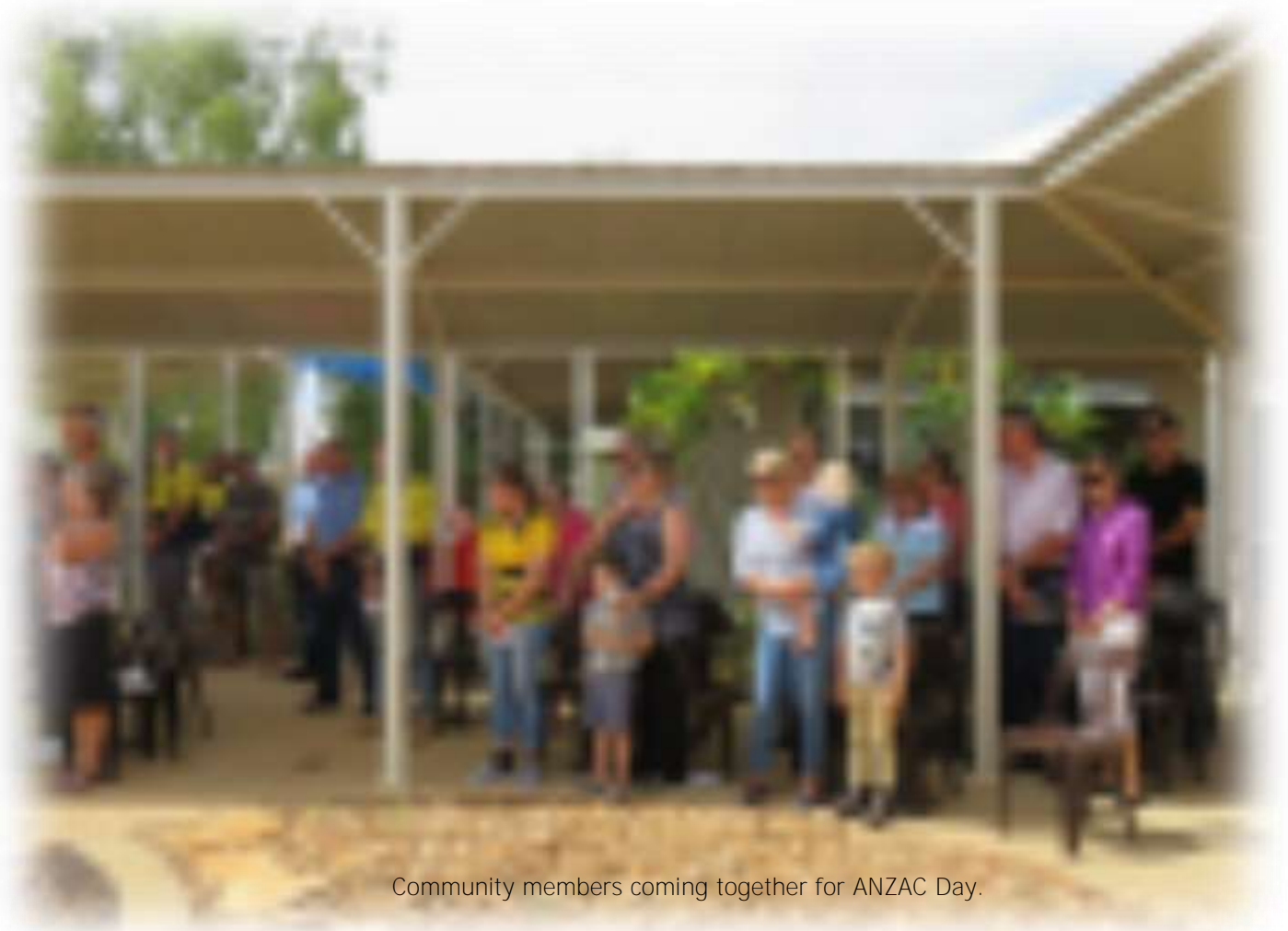
Community members coming together for ANZAC Day.