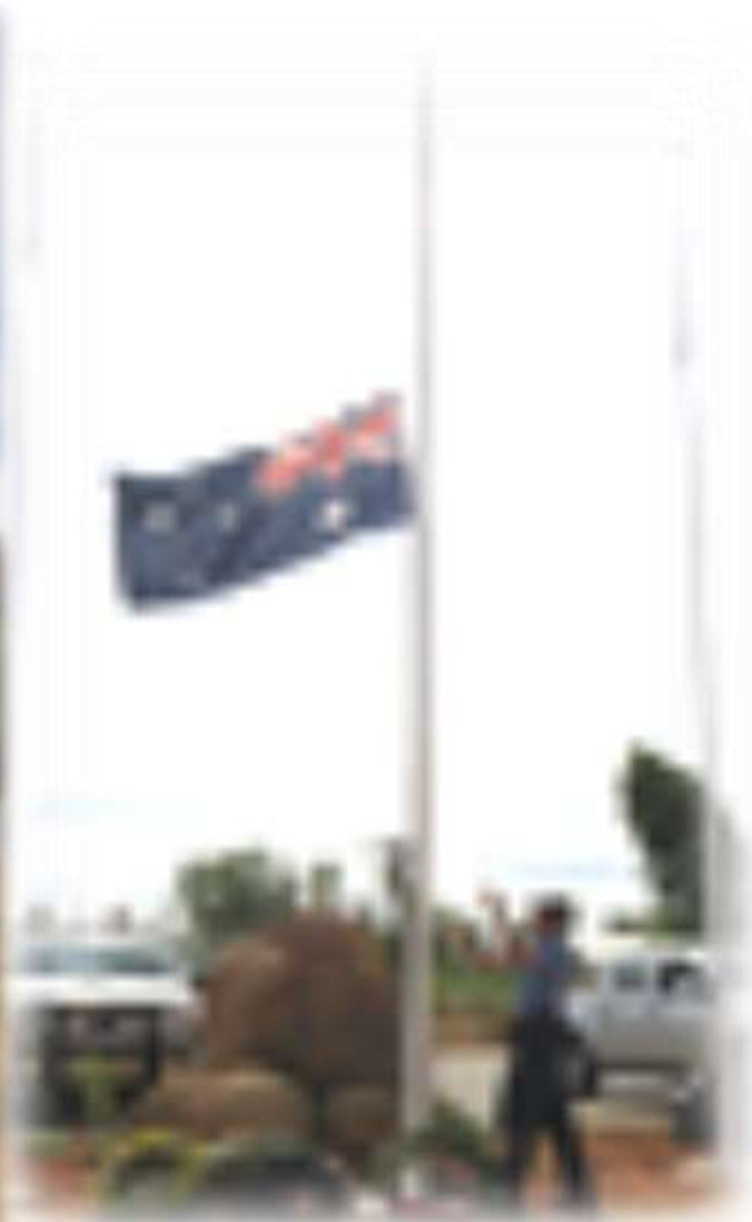
Raising of the flag by: Constable Reece from Burringurrah police.